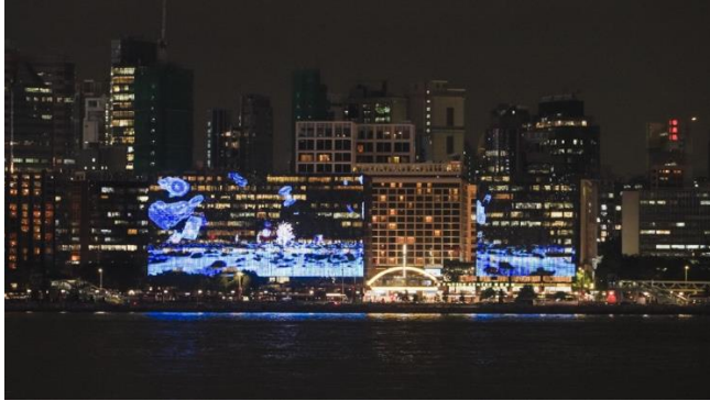
Lost and Found by Ng Tsz-kwan

Over a decade ago, the notion of “decluttering” began to prevail. People gave away their unnecessary belongings to let go of material possessions and obsessions. Nonetheless, of the things that we casually discarded, where did they go? Perhaps they were still lingering around and were never lost, all along, they continued to exist in different forms. The ambiguous demarcation between them and us remains undeniable. Blurring these lines is not as easy as it may seem.